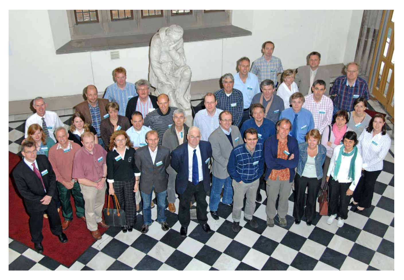
The ParaTB Tools group at their recent meeting in Spain. See the next page for a list of participants.

The ParaTB Tools web site is now on line, and is under construction. The ParaTB Tools objectives are listed (click on the "info" link), along with a directory of all the ParaTB Tools collaborators, with full contact information. Go to <a href="https://www.paratbtools.com">www.paratbtools.com</a> for information.